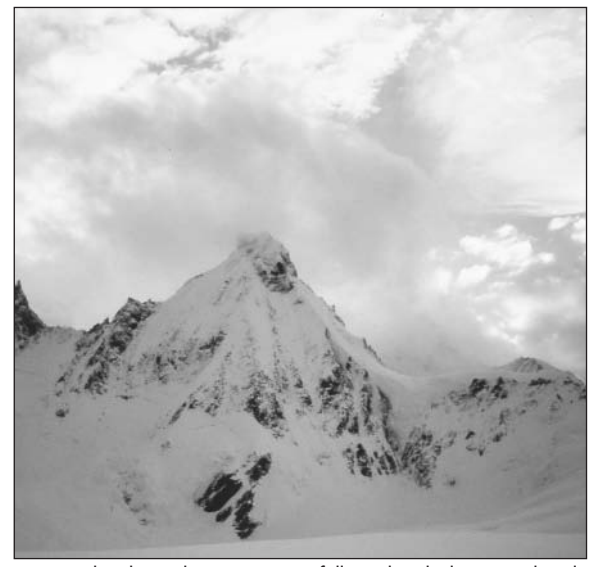
Monte Ada: The Parkins-Yates route follows the rib dropping directly at the viewer in the center of the northeast face. Simon Yates

We soaked up the views for a full hour before turning our attention to getting down. We abseiled from the summit ridge, following the line we had climbed through the evening, continuing after it became dark. When we reached the steep section in the